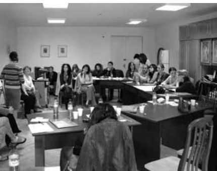
Armenia: Workshop

education are not included. The two multi-profile community centres for adult education that were established several years ago on the initiative of dvv international in the Samtske-Javakheti Region of Georgia (with financial support from the EU and the Federal Government of Germany), were modelled on the German “ Volkshochschule ” (Community Adult Education Centres). Similar centres are planned for Armenia and Azerbaijan in the current year and next year; at least four more institutions of this kind will be established in Georgia.