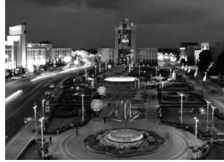
Independence square in Kiev