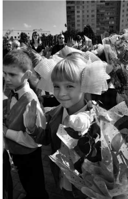
First day in school

Training of trainers remains one of the most common forms of preparing specialists for non-formal education. Quite often, it is an integral part of larger projects aimed at the resolution of certain social problems or working with a specific target group. The participants, along with studying principles of Adult Education, receive information about the subject matter and acquire key methods and practices of working with the audience. These programs, as a rule, are highly effective for participants. However, one of the shortcomings is a lack of regularity. In order to become a vocational trainer there is a need to supplement training with the inde-