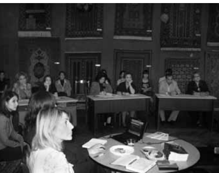
Project Consultations