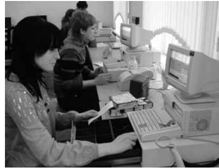
Formation of salesladies in Belarus