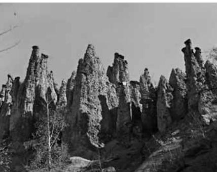
Mountains in Serbia