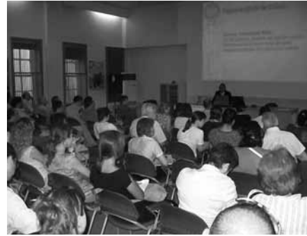
Training the trainers

and to carry out production-oriented activities regarding apprenticeship and non-formal education. Since 1995 the institute has been attached to the Directorate of Apprenticeship and Non-Formal Education. The main research topic of the institute in the 2009 Action Plan was to “compare the Turkish non-formal education system with the developed/EU countries’ systems and make suggestions about their alignment”. The action plan also states that the institute will conduct research on problems encountered in vocational education and the effects of non-formal education on the Turkish economy. The institution has yet to produce any significant publications about non-formal education or vocational education and is being criticized for being ineffective due to incorrect personnel selection and bureaucracy problems.