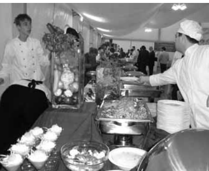
Practical training for cooks