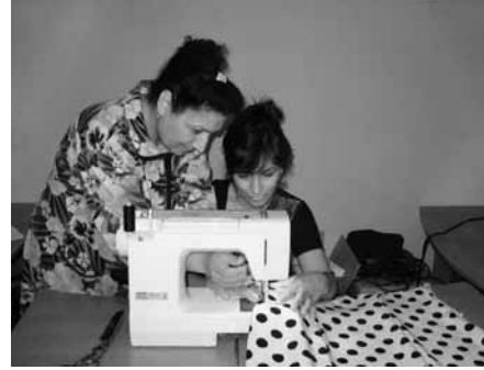
Sewing course

Finally, it should be noted that neither is research being conducted nor is any statistical information being gathered in this region to determine the participation rate in adult education. The one and only study on this topic which is comparable to European research was performed in 2005, jointly by dvv international and the Adult Education Association of Georgia. The study brought to the fore the traditional picture of adult education: on the one hand – the higher the education level of a person, the greater is his/her willingness to get involved in adult education; but on the other hand, actual participation in adult education shows clear signs of gender imbalance : much higher involvement of women compared to men.