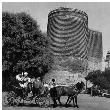
The Maiden Tower in Baku

The Ministries of Education and Science (MoES) of the three South Caucasian countries could be considered responsible for the AE in the region, even if there are not any structural units in the ministries specially covering AE issues. Usually, the departments for Voca-