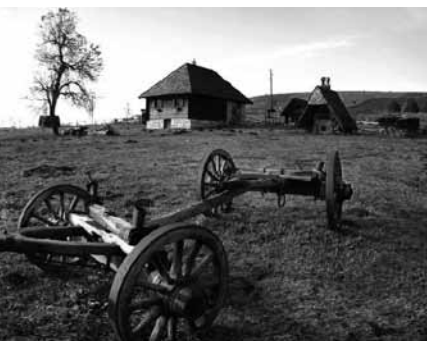
Rural region in Serbia

lever for economic and social progress. The new democracies in former socialist countries face the difficult task of developing a modern adult education system and overcoming the gap between real learning needs of adults and still very poor provision. Tradition-oriented school systems, inflexible and still rather conservative, are not able to cope with the new problems and challenges. Also, the state is usually not capable or willing to prioritise adult education. Therefore, others mechanisms had to be developed to help adult education to meet the demands of new political and economic realities. For a better understanding of the difficulties that many of the Balkan countries still have in establishing the system of lifelong learning and adult education, problems and challenges in some single aspects and areas will be depicted.