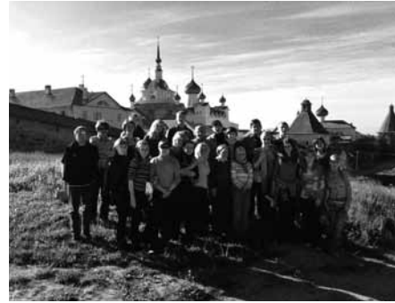
History workshop for young people

The Russian Law on Education , which guarantees that "the education system is adapted to the trainees' development and training levels and characteristics," stipulates that any adult can improve his/her educational status starting from the lowest level (including mastering basic literacy skills) within the state system of evening general schools. The reality is that the opportunity for an adult to become literate exists on paper only. First of all, in recent years the number of general state evening schools has been reduced significantly in most regions. New evening schools are being organized only in the regions affected by conflicts and hostilities.