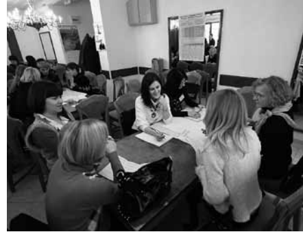
Vocational training