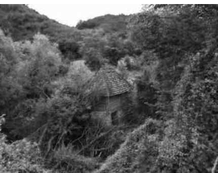
Tract of forest in Serbia