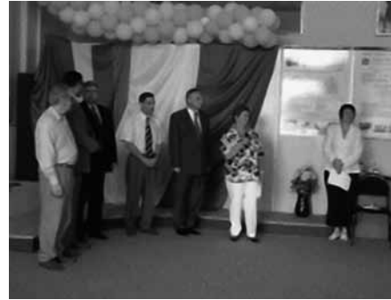
Training for elderly