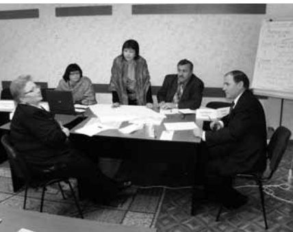
Training of trainers in Moldavia

Analysis of the institutional structure of education in Belarus, Moldavia, and Ukraine shows that over fifteen years, adult education practice has emerged from government monopoly, and there has been a gradual transition to a multi-polar system based on the interests of the government and various social groups and individuals.