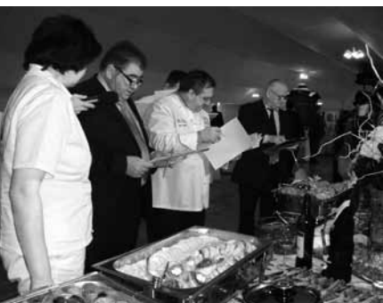
Exams for cooks