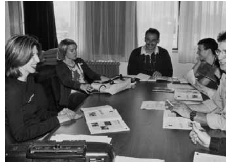
Seminar in Belgrade

Although the amount for adult learning and education programmes and projects in Croatia has been notably increased in recent years it is still impossible to get a real overview of the total expenditures for these purposes (particularly at the lower level of government – local and regional self-government units). Also, resources for 2007 and 2008 planned for lifelong learning and adult education were not wholly presented under the Ministry of Science, Education and Sport and/or the Agency for Adult Education but were included in the budgets of other ministries and bodies. For that purpose it is necessary to approach each of these bodies separately. However, only a few examples will be presented in order to illustrate the variety of institutions and programmes for which funding is provided from the state budget.