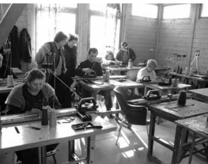
Weaving in Armenia

The aims of adult education have also changed. During the Soviet period, after the massive illiteracy problem was resolved (often by using violent methods), adult education was described from one point as a continuous professional education (as deriving from the professions; basically, permanent qualification development inside one profession) and on the other hand permanent ideological political education of the masses.