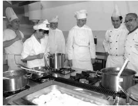
Practical training for cooks

Formal education programmes differ in programme length, curriculum content and the complexity of the occupation. Those are also the elements which determine the programme price. Advanced professional training programmes are the shortest, and the cost of these programmes ranges between HRK 1,500 and HRK 6,000, while the cost of finishing one year of secondary school ranges from HRK 4,000 to HRK 8,000.