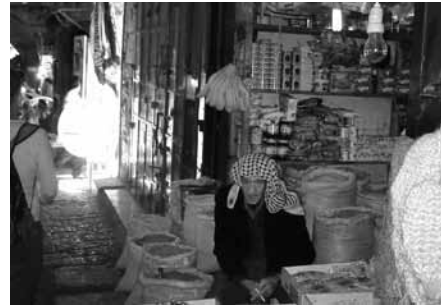
Market in Jerusalem

Leisure and enrichment are an important element of the lives of the elderly , as this period in life often permits great learning opportunities. Learning is also important for maintaining health and mental acuity, and as such, the demand for adult learning for the elderly is increasing. The elderly are motivated and critical learners. In 2006, there were 697,600 Israelis over the age of 65, nearly 10% of the total population. Nearly half of those were over 75 years old. In this group, 57% were women. Life expectancy in Israel is 78.5 years for men and 82.5 years for women. Among senior citizens, formal education is inversely correlated to age: the older a person is, the more limited her/his education. These numbers are even worse in the Arab sector. Among Jewish elderly, 35.4% had less than eight years of schooling, 31.7% had up to 12 years of schooling, and 32.9% had over 13 years of schooling. Among the Arab, Druze and Bedouin communities, 82.1% had less than eight years of schooling, 11.8% had up to twelve years, and few had over 13 years. The Jewish elderly express far greater interest in learning than non-Jewish elderly.