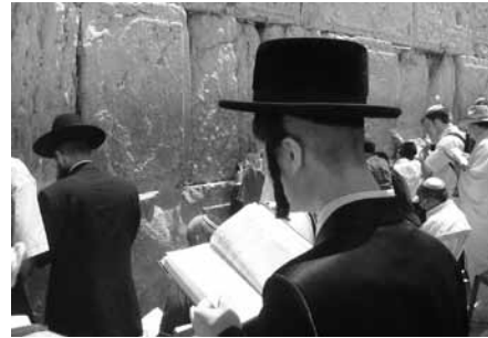
The Wailing Wall in Jerusalem

It is clear that a national policy vision is needed. The Israel Adult Education Association (IAEA) , a not-for-profit organisation and leading non-governmental advocacy group for Adult Education in Israel, has been promoting this vision of ALE throughout the governmental system, and was a leading voice and lobby preventing the threatened disbanding of the DAE in the Knesset a few years ago. Today, the IAEA, which is a member of and active contributor to European networks for ALE, is promoting a National Policy for “ Israel: A Learning Society ”. A joint working group of the DAE and IAEA prepared a document, focusing primarily on adult learning (ages 20–80). The policy recommendation document focuses on three strategic goals: placing lifelong learning at the centre of the public agenda; advancing legislation and public funding for lifelong learning; and ensuring access to lifelong learning for all citizens, regardless of age, gender, race, socio-economic status, abilities and limitations. The policy recommendations, which include detailed analyses of operative objectives based on these three strategic goals, will soon be presented to potential supporters, fund contributors, and partners in order to systematically promote adult learning and education in Israel.