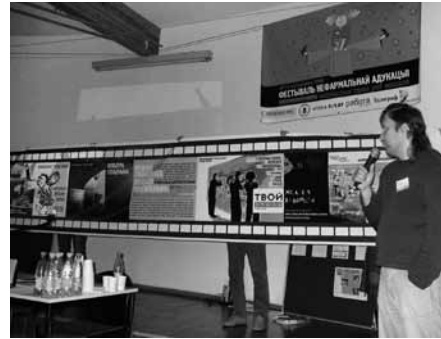
Festival of non-formal education in Minsk