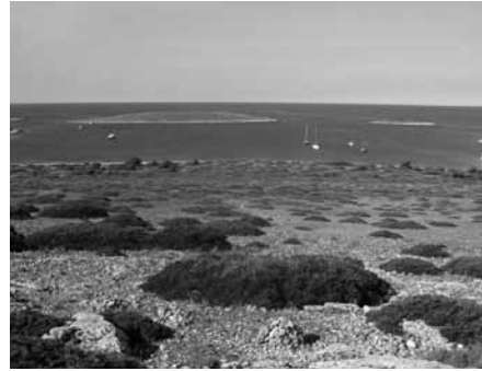
Kornati National Park