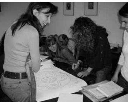
Armenia: Workshop

(Grades 10–12). However, given the current enrolment capacity of higher educational institutions and the VET system (the number of openings for applicants is too small!) only half of the secondary school leavers manage to access the formal education system. The other half of them are practically lost and are thrown straight into the labour market without any additional training. Naturally, such young people have an extremely low chance of finding a job. This accounts for a very high level of unemployment among young people up to the age of 25 in Georgia.