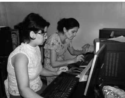
Azerbaijan: Computer course for women