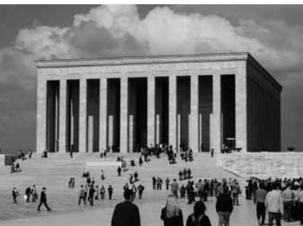
Mausoleum in Ataturks

Turkey lacks systems or programs that are directed toward the education and training of adult education teachers and trainers.