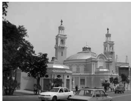
The Philharmonic Concert Hall in Baku

Adult vocational education is partly implemented by state and private institutions of vocational education in Armenia and Azerbaijan. Tuition fees are basically covered by the Ministry of Labour (employment services) for separate registered jobless individuals, refugees, IDPs; by the Ombudsman's office for mentally challenged and disabled individu-