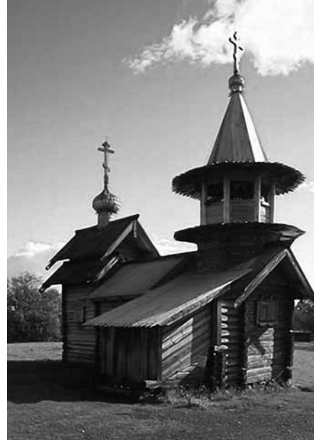
Wooden church in Kizhi