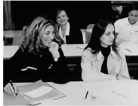
Seminar in Croatia