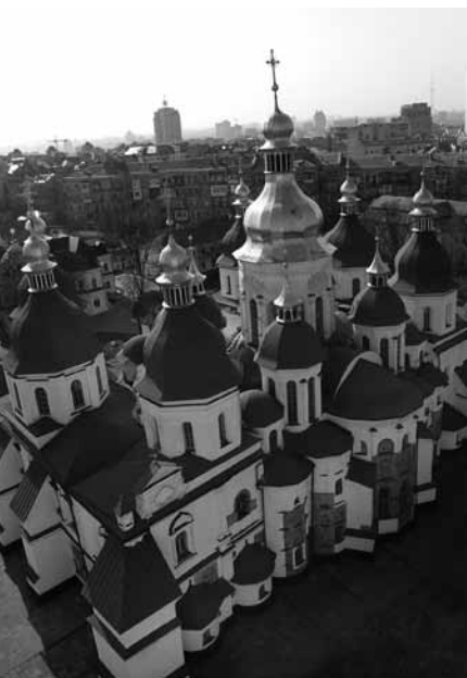
Sofia cathedral in Kiev

services are entirely funded by the students, with the exception of retraining.