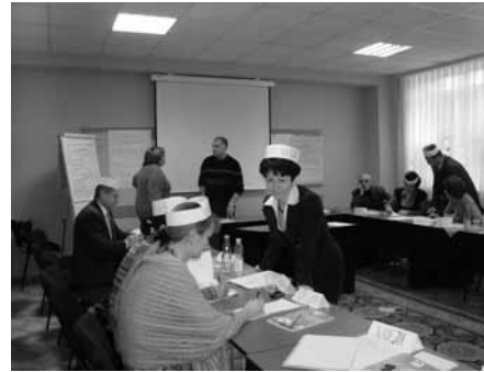
Training for adult education

The academic community in the Ukraine (with active involvement of the Bureau “Adult Education of Ukraine” 8 ) in 2004 attempted to lobby for the Law “On Adult Education”.