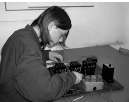
Course for electrotechnicians