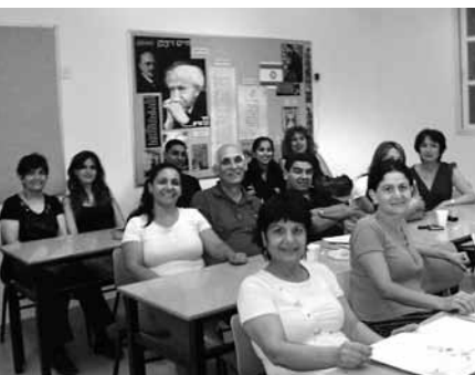
Russian course in Tel Aviv