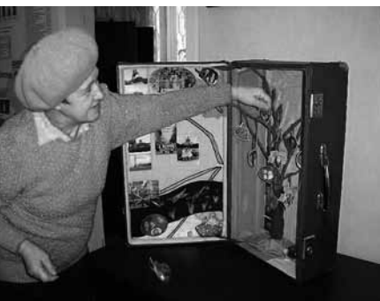
Memory suitcase – Exposition in Novosibirsk 2007