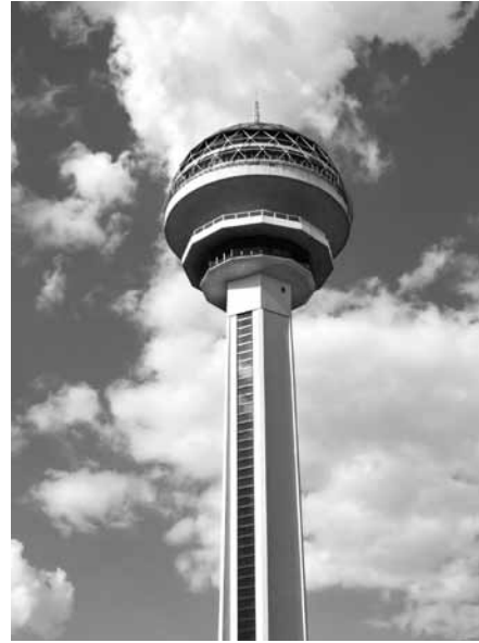
Ankara – Atakule

As the most important foreign supporter of Turkey's education on the financial and technical levels through various projects and programs, the European Union should continue its support in this relatively new educational field. Implementation of an EU standard Lifelong Learning system is a requirement for Turkey in the candidacy process. On the other hand, as mentioned before, MoNE's allocated budget to non-formal education is inadequate for serious adult education operations to take place. There is also a shortage of human resources that is knowledgeable about lifelong learning and willing to take it to the next level. Thus Turkey needs help from the EU and other international partners in order to overcome these issues. Specifically, the European Union, by working with local partners should green-light multiple projects regarding the founding of a high-quality lifelong learning system for Turkey that will comply with the Lisbon strategy.