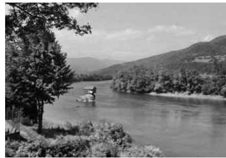
River landscape in Serbia