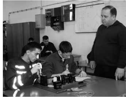
Formation of electrotechnicians

Act on Job Placement and Unemployment Insurance, put in force in January 2009, regulates mediation for employment, training and vocational guidance for employment as well as professional rehabilitation of unemployed disabled persons.