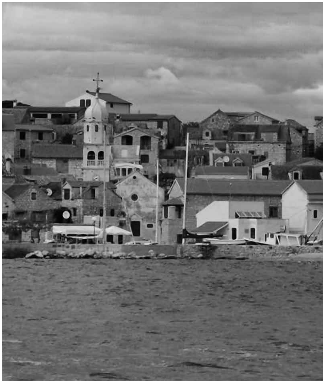
Šepurine at the Island of Prvič