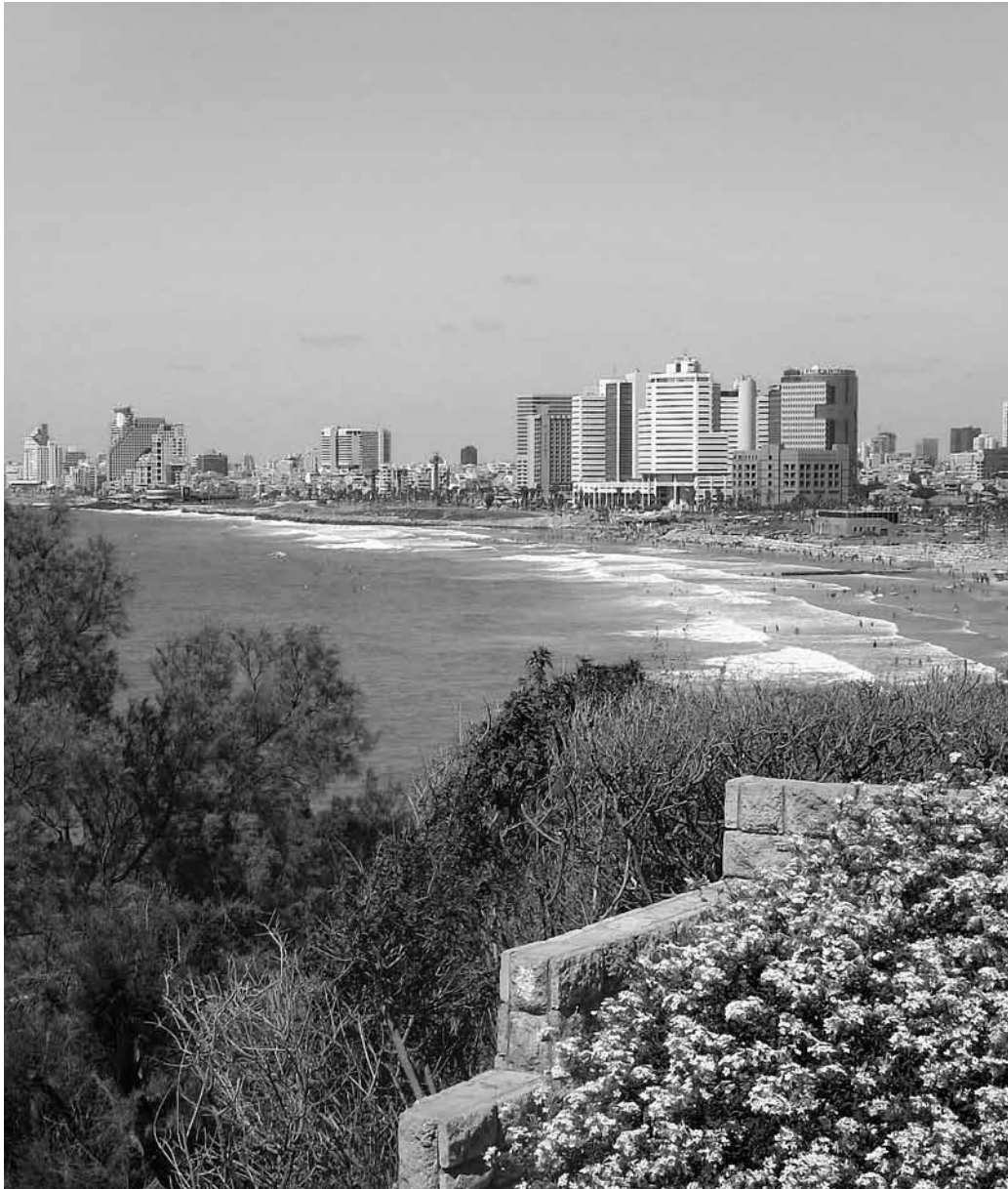
The Skyline of Tel Aviv