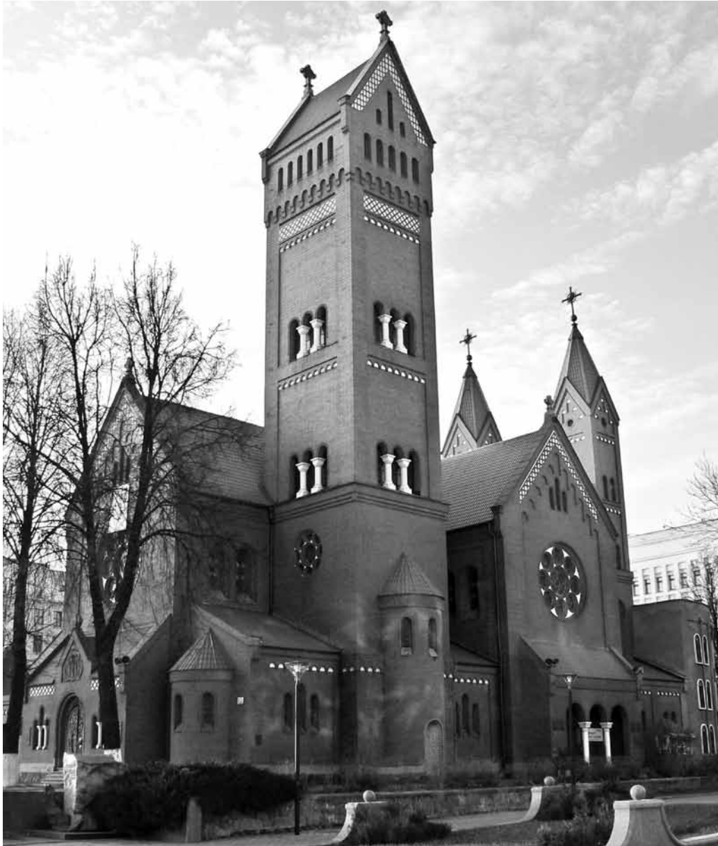
The Red Church in Minsk