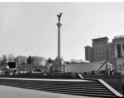
Independence square in Kiev

of national cultures and languages, research and preservation of local history, development of overall civic culture, including nonviolent conflict resolution methods, are common to the countries. The Transdnistria conflict remains unresolved, and the situation in the Crimea is aggravated from time to time.