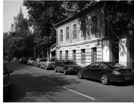
Moscow: a city of contrasts

In Russia, European and American foundations and organizations, 5 whose activities are associated with allocating funds to support Russian non-profit organizations, exercise the strongest influence. Last year, the Ford Foundation alone allocated over two billion dollars to Russian NGOs. Their objectives may differ – support for the poor, civil society development, rights protection, support for young specialists and scientists, health care development and health promotion – however, they somehow deal with adult education as well (professional training of personnel, comprehensive training programs, training of multipliers, indirect training when knowledge is disseminated and “multiplied” through trained local personnel, support for publications, etc.).