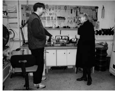
Master craftsmen examination

The budget for the development and delivery of in-service training and education programmes for civil servants was approved for the first time in 2007 – HRK 2 million for the Central State Office for Administration (CSOA), and HRK 273,000 for the operational costs of the Civil Service Training Centre (CSTC). The salaries of CSTS staff were not covered from these funds. In 2008, HRK 2.3 million was approved for the special CSOA position in the state budget and HRK 280,000 was approved for the operational costs of the CSTC (for general education and training programmes and for general specialist education and training programmes). Additionally, as was the case in 2007, all state administrative institutions have their own additional training and education budgets for specialist education and training programmes.