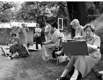
Course for women