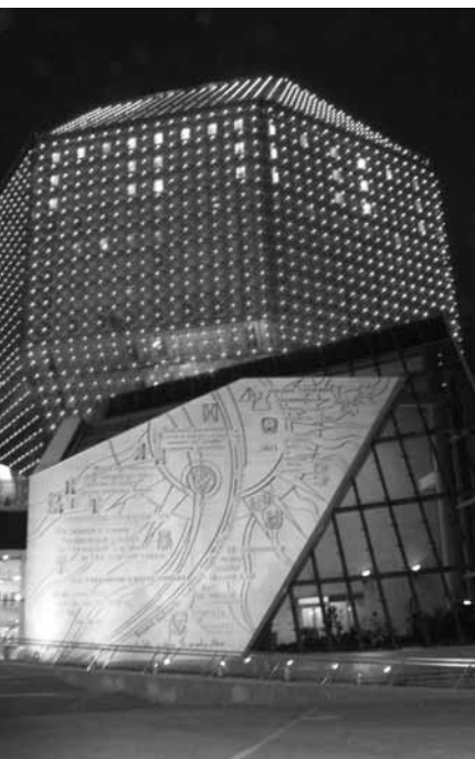
National library in Minsk

Moldavia. According to official data, in recent years, nearly 300,000 people left Moldavia, and of those, 56% left the country to work in Russia. According to the Ministry of Labor and Social Policy of the Ukraine, 1.5 million people (about 5.1% of the workforce) work abroad. In 2008, 48.4% of Ukrainian labor migrants were in the Russian Federation and almost the same number were in the countries of the European Union.