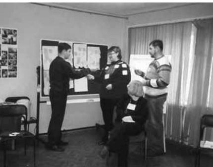
Seminar for interactive methods