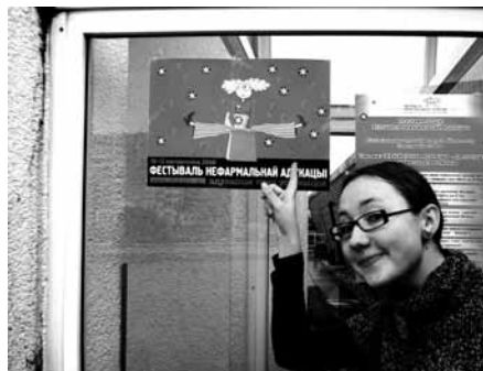
Festival of non-formal education 2008

In big cities, universities and institutions of higher education play a prominent role. They offer retraining services and establish centers to render services to the population. Most common lines of their activities are computer literacy and language courses, university pre-admission training and others. In contrast to vocational development, these