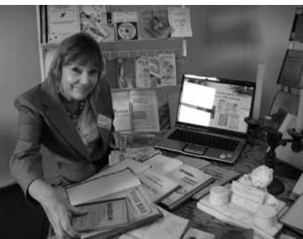
Festival of non-formal education 2008

A right to education was, undoubtedly, formalized in all constitutions and laws on education in the countries of the region.