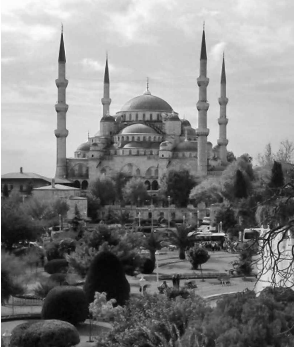
The Blue Mosque in Istanbul