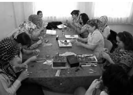
Public Education Center course source: dvv international

Another ministry that is interested in the adult education activities in Turkey is the Ministry of Labour and Social Security . As stated in the Vocational Qualifications Association Law above, the Vocational Qualifications Association's main goal is to implement a national vocational qualifications framework based on vocational standards. This includes adjusting, modifying and recreating the current curricula of vocational training in Turkey according to the newly implemented framework. Thus the Ministry of Labour and Social Security and the Ministry of National Education are expected to increase collaboration on the issues of Adult Education in the future.