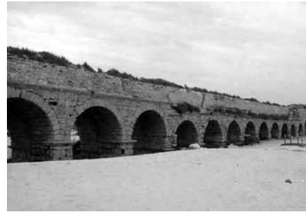
Caesarea, a famous ancient town in Israel

Another leading programme for women was Mila Tova that provided a response to the unique needs of Ethiopian immigrants after their studies at Ulpan. This was one of several key programmes for immigrant women from different regions who faced a variety of social, economic and cultural challenges. The Mila Tova programme entailed 280 annual classroom hours for over 1,000 women from 29 communities. It sought to: integrate learners in educational programs, thereby enabling them to earn tenth grade or high school educational equivalency; integrate learners in existing basic education frameworks; foster dialogue between immigrant parents and the education system; and provide socially appropriate parenting skills. Since Mila Tova classes consisted of about 80% women, materials and emphases in the study content addressed the needs of women. The programme was run as a collaboration of the JDC, DAE and IAEA.