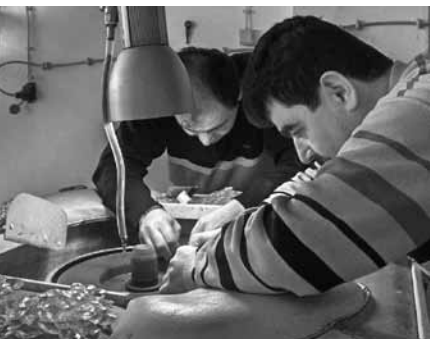
Vocational training