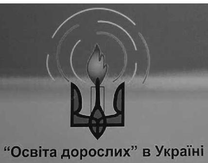
Emblem of the Ukrainian week of adult education