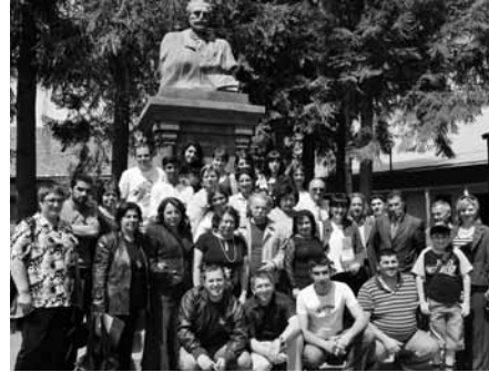
Participants in the EU project A-Muse-All

Yet another vivid example: as noted above, the reform recently carried out in the VET system of Georgia failed to make this sub-sector attractive for students who have completed the 9th grade (due to a dead-end situation on the educational path for this group of students). No wonder that 95-to-98% (numbers vary slightly from year to year) of students who have completed the 9th grade choose to go on and complete secondary school