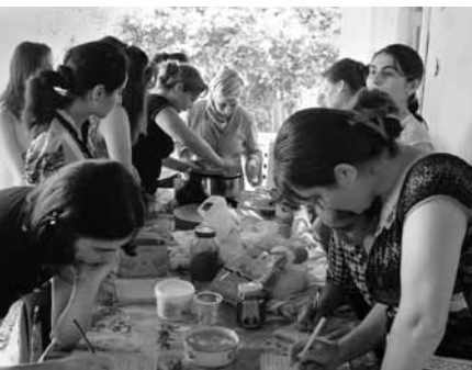
Cooking course in Azerbaijan

ment), training needs of various vulnerable groups, provider type investigation and their registration (creation of database), etc., are provided through their contribution. Various recent policy papers have also been prepared by these associations.