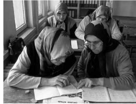
PEC Literacy course

PECs are able to provide free education services between 07:00 and 24:00, including weekends. There is a twelve-person minimum participation limit in order to open a course although it is not strongly enforced. Courses for people with disabilities, homeless children, ex-convicts and drug addicts in treatment can be opened with any number of participants.