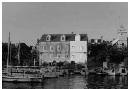
The Island of Zlarin