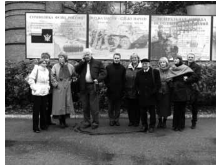
Course for human rights