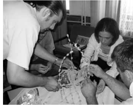
Vocational training

Ongoing efforts in the area of quality are related mostly to criteria for the institutions (and other providers), criteria for the educational programmes and criteria/competencies for Adult education staff (needed for their licensing as well).