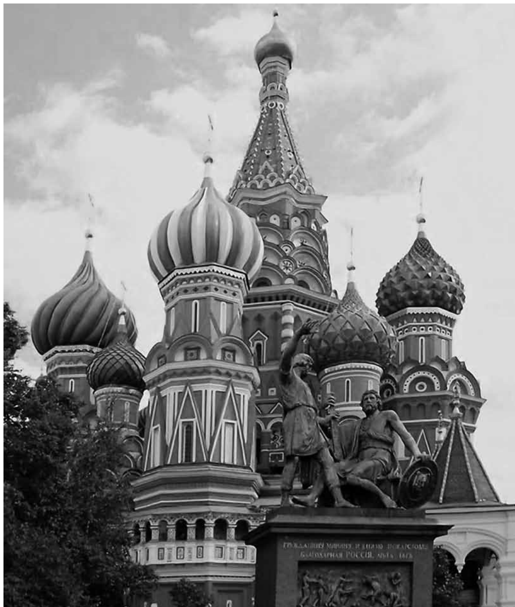
The Basilica Cathedral in Moscow