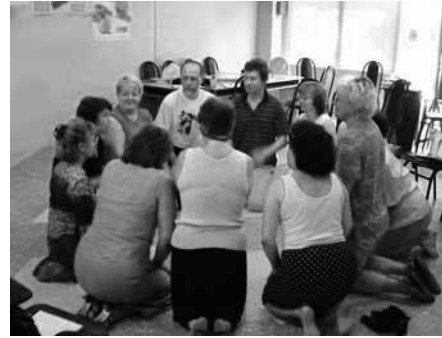
Training of the trainers

Another academic institution – the Institute for Comprehensive Social Studies of the Russian Academy of Sciences – has selected a special focus of AE research. Research on the