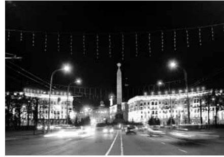
Victory square in Minsk

It should be noted that a synergetic effect was achieved through cooperation between the BSP and divv international with a network of Belarus NGOs, the "Organization of Civic Education" (known as the AGA in Belarus) 25 . Thanks to joint efforts in Belarus, two large-