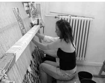
Public education course