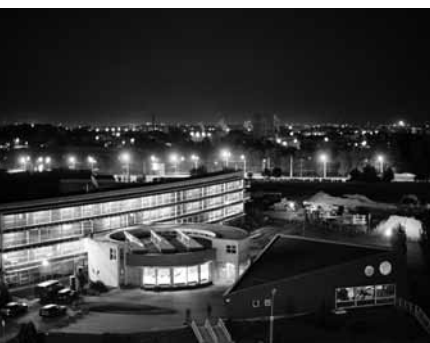
International educational centre

This initiative failed to find support from state bodies and deputies, hence it was suspended. The process of developing national legislation continues. Belarus and Moldavia have developed drafts of the Education Code which are to be considered by their parliaments in the near future.