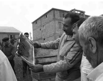
Bee-keeper in Azerbaijan

In order to implement the adopted strategy, 2005 the National Assembly of the Republic of Armenia adopted the Law on Initial (Craftsmanship) and Middle Professional Education and Training where the term Adult Education (in the context of vocational education and training) was used for the first time in a law of the country. Based on the above mentioned strategy, the government of Armenia approved by the end of 2005 the Concept Paper and Strategy of Adult Education .