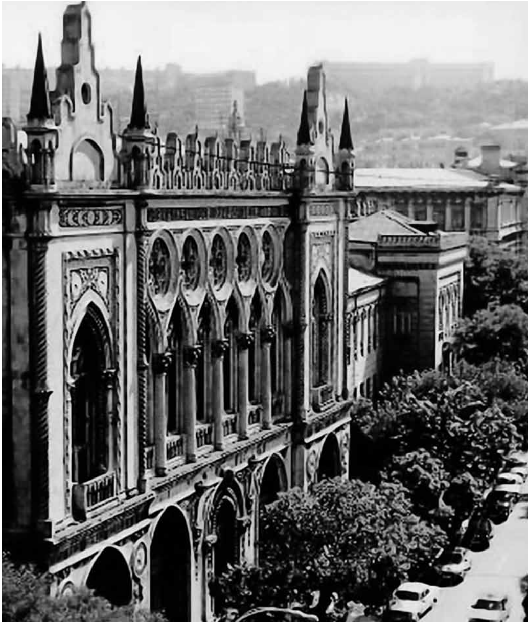
The Academy of Science in Baku