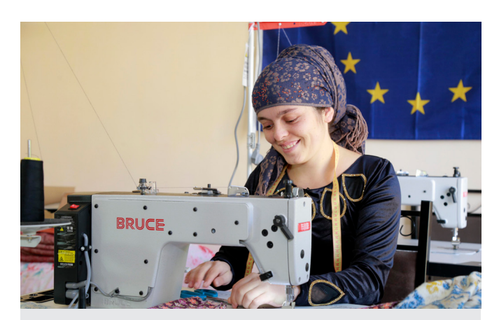
Participant of small grand programme within the frame of the EU co-funded project "Promotion of Social Change and Inclusive Education" (INCLUSION).

education suffers from an abiding lack of qualified specialists in technical specialties. The low level of knowledge of foreign languages holds Tajikistan back in the global arena.