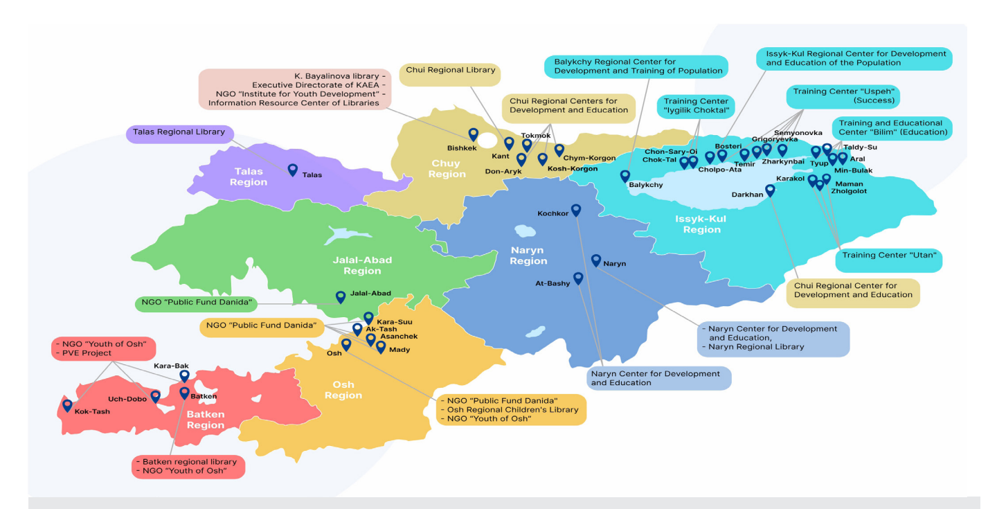
Map of Adult Training Centres – Members of the Kyrgyz Adult Education Association (KAEA). The location shown for Bishkek is KAEA's head office.

A firm legislative base is needed to secure funding of ALE. Creation of adult learning policy must be based on solid evidence highlighting the most effective practices and interventions. Resourcing is at present haphazard, various, often insecure, and in most areas of ALE need, inadequate. Clear policy commitment, legislation, and enforced regulations, including budgetary requirements, are essential to embed ALE within an applied commitment to nationwide lifelong learning as a right, and to secure its accessibility especially to remote communities and those with special needs.