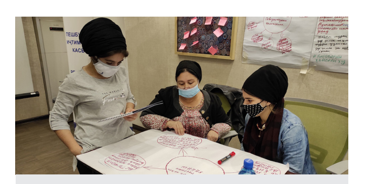
Training of trainers on basic literacy course for local CSO networks.

Coordination is poor, with no involvement of the general public, an expert community, or employers, in the discussion of problems and prospects for the development of education, especially legislation and strategies; there is one-sided emphasis on the development of the State segment of education, including in ALE.