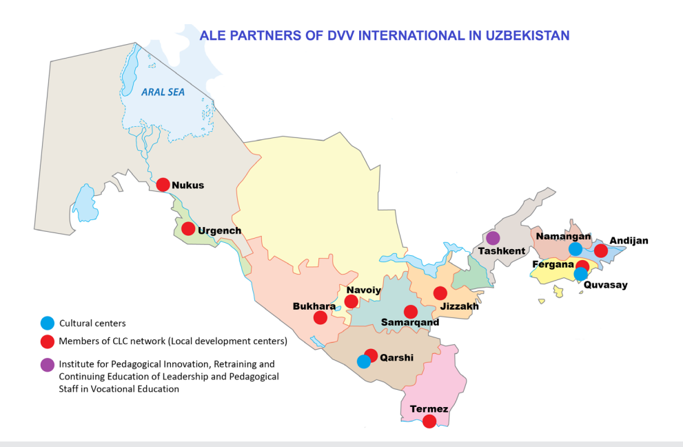
Map of Uzbekistan. Locations of civil society organisations involved in ALE partnering with DVV International are shown in red.

Statistics on financing education provided by the Educational Sector Plan of Uzbekistan (2019-2023) show that formal educational institutions (including adult education) have stable funding. However, the informal sector has no comprehensive ALE funding or statistical reporting system. The absence weakens decision-making for developing an ALE policy.