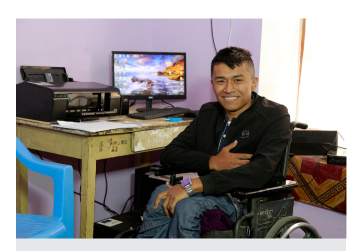
Participant of the EU co-funded project "Promotion of Social Change and Inclusive Education" (INCLUSION).

The website of the AEAT provides information about ALE, legislation, statistics and trends in ALE, and projects being implemented. But it has not yet been possible to create a national platform for dialogue and exchange of best practices and experience.