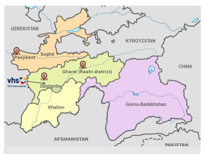
Map of Tajikistan, where DVV International is represented by the country office in Dushanbe coordinating with Adult Education Centres and Community Learning Centres throughout Tajikistan.

Laws and arrangements are in place, but the amount of education budget allocated to ALE is miniscule. The State is unable to develop all segments of education equally, but the need for training is high. There is a lack of andragogic specialists throughout the system – politicians, managers, methodologists, and ALE teachers. The country's education system does not prepare them. The scientific potential for studying ALE is also weak; there are few methodological manuals and other tools and arrangements useful for organising adult learning. At present, a programme for andragogy is being implemented by DVV International with local partners, based on adapting and officially recognising the global core curriculum for the training of adult educators – Curriculum globALE.