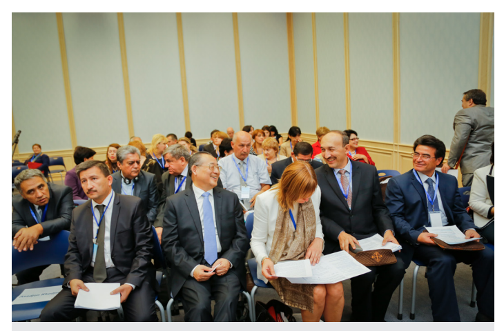
Participants of the international conference on Adult Learning and Education in Uzbekistan, 2014.

The three countries are each committed to UN-led development planning to implement the SDGs, which run from 2015 to 2030. Each country was invited to prepare a country report on ALE for UNESCO in the context of CONFINTEA VII, and to join the Subregional consultation. They will be participating in the Regional Conference in 2021 and then to the global Conference in Marrakesh in 2022.