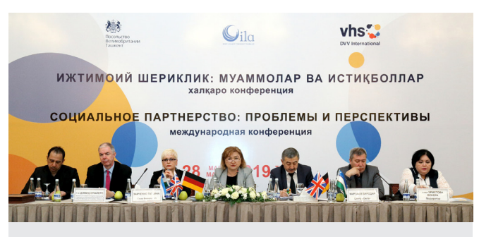
International Conference on Social partnership: Challenges and perspectives» in Uzbekistan, 2019.

The financial sustainability of NGOs in Uzbekistan is a serious high priority problem. Parliament established a Public Fund to support NGOs, a State Social Order for training in non-state vocational educational institutions at the expense of the State Employment Promotion Fund under the Ministry of Employment and Labor Relations. These are, however, still inadequate to support the further development of NGOs' ALE offers.